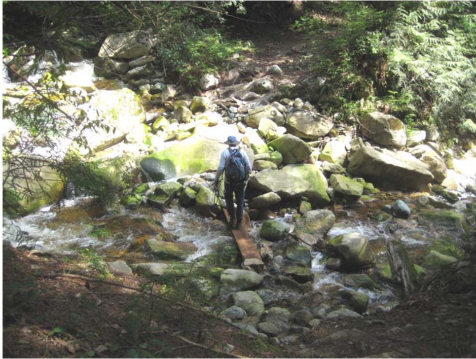
Ian at plank crossing of Prtichett Creek.

will eventually reduce the scope of what one can see. Later, a hummingbird flew right up to us and then away.